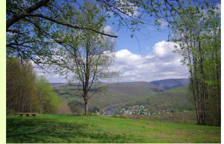
Tharp Knob Overlook

Please note that the location you choose will not be closed to the public and parking may not be reserved. On a busy day you may have hundreds of onlookers. Electric is not provided so please make appropriate arrangements. Set up and tear down of chairs, flowers, decorations, etc should be done as close to the commencement and completion of the ceremony as possible.