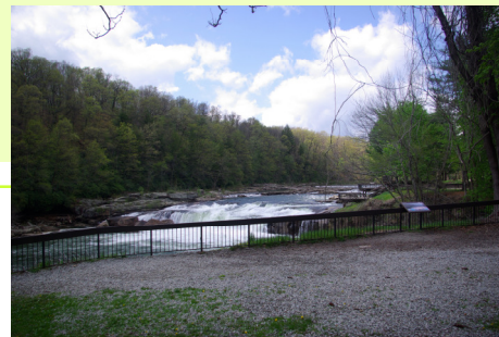
Gravel Overlook Ohiopyle Falls